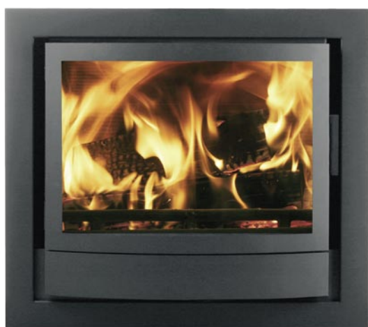
IT43 - Graphite

In addition to the comforting radiant heat they generate, Nestor Martin inserts can distribute their warmth throughout the home. The IT and ITH models are equipped with integrated fans, as well as with two hot air outlets which allow you to channel the warmth of the stove into other rooms of the house.